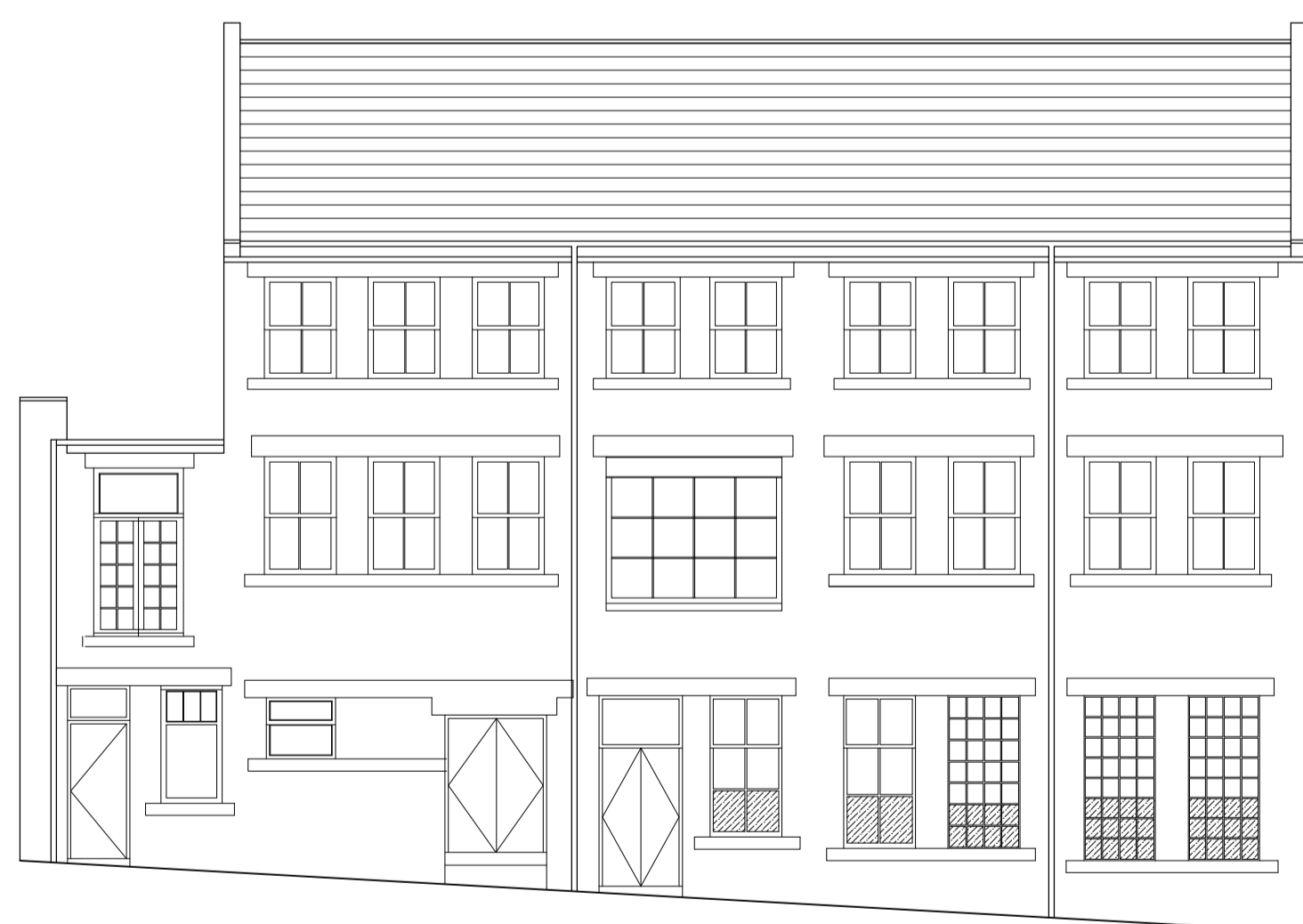
Peel Street - West Elevation (1:100)