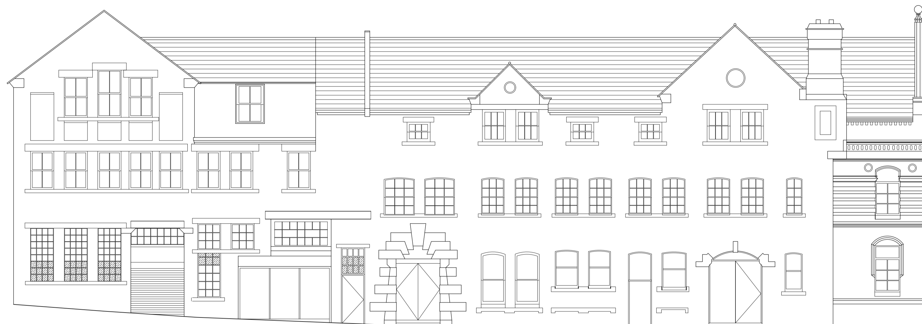
Peel Lane - South Elevation (1:100)