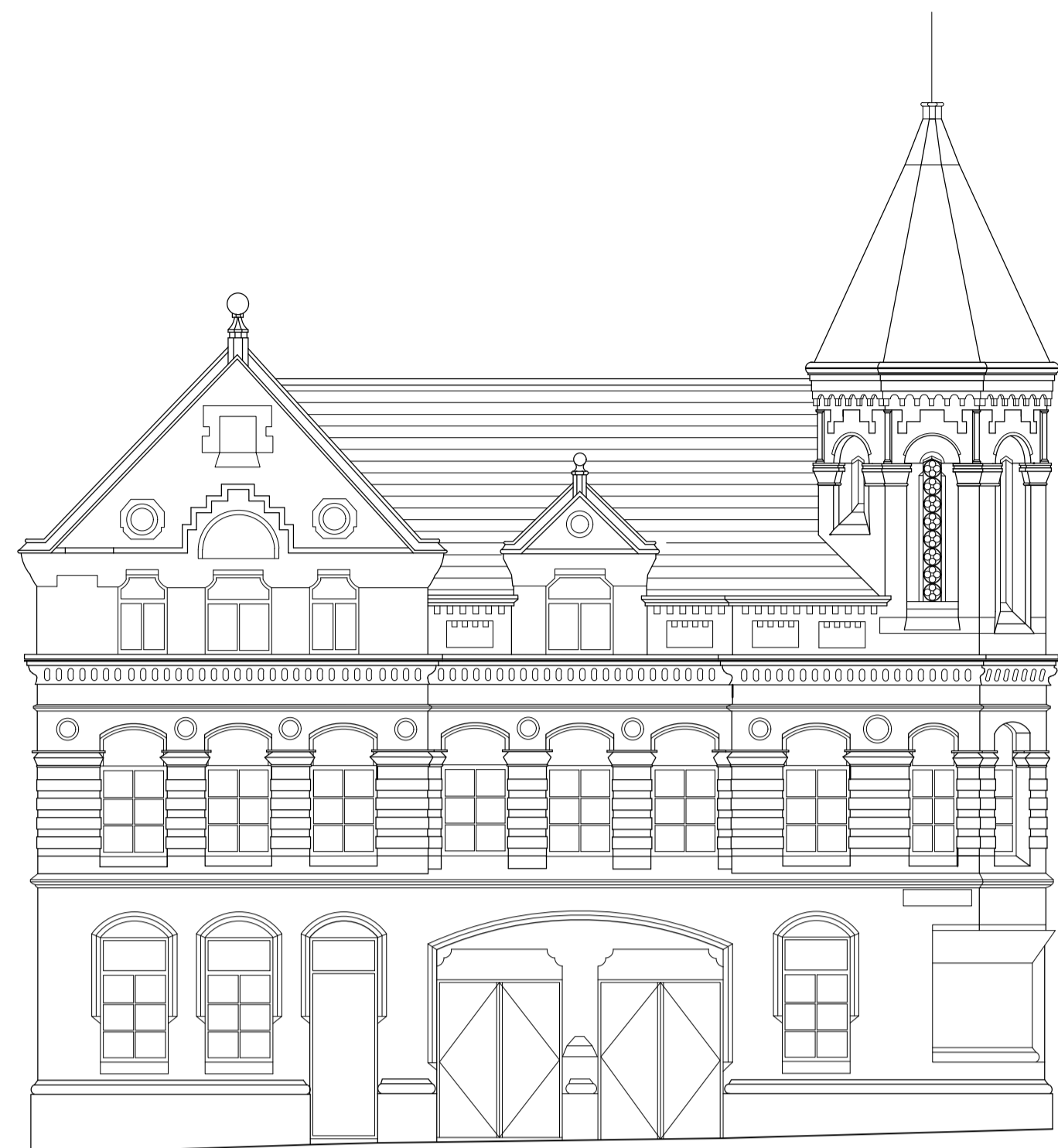
Waterloo Street - East Elevation (1:100)